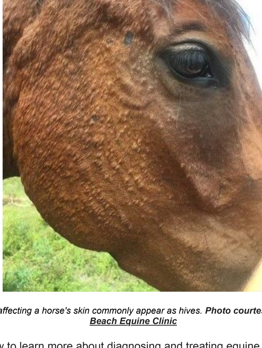
Allergies affecting a horse's skin commonly appear as hives.

The same allergens that cause respiratory symptoms can also cause skin reactions, but veterinarians tend to approach treatments differently for the two types of reactions.